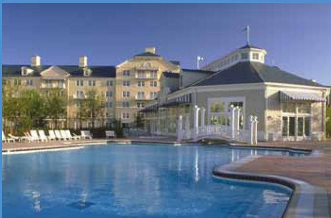
Disney's Newport Bay Club® - © Disney

For the 2010 Convention a top-class venue has been arranged. A perfect place to dream of !