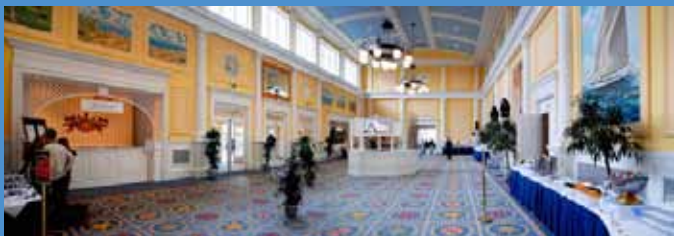
Reception hall - Disney's Newport Bay Club® convention center - © Disney